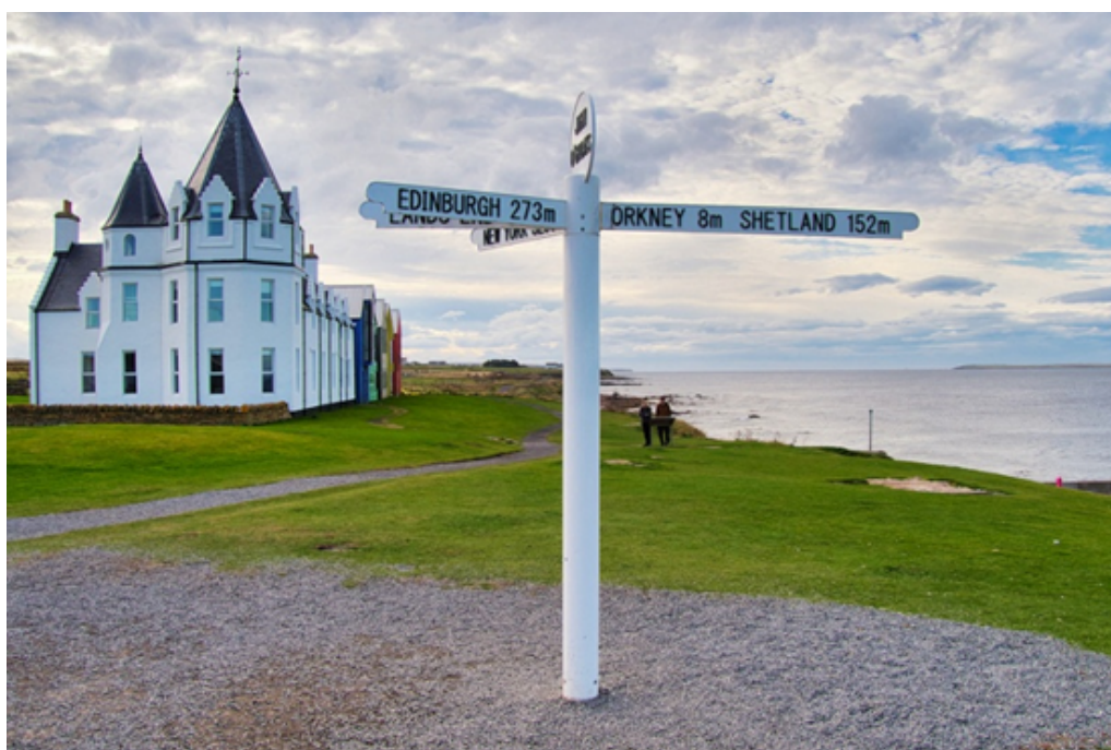
The John O'Groats signpost

*Sabbatical- Every Minister is expected to take a regular sabbatical period of three months, as a period for re-equipping, refreshment and renewal. This year it will be 17th year since I started in ministry and so my second sabbatical is now due. My sabbatical begins on Monday 4th May and I return to regular duties on Saturday 1st August. My colleagues are available to support if required in my absence.